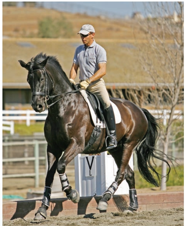
Don Antello performing Prix St. Georges movements.