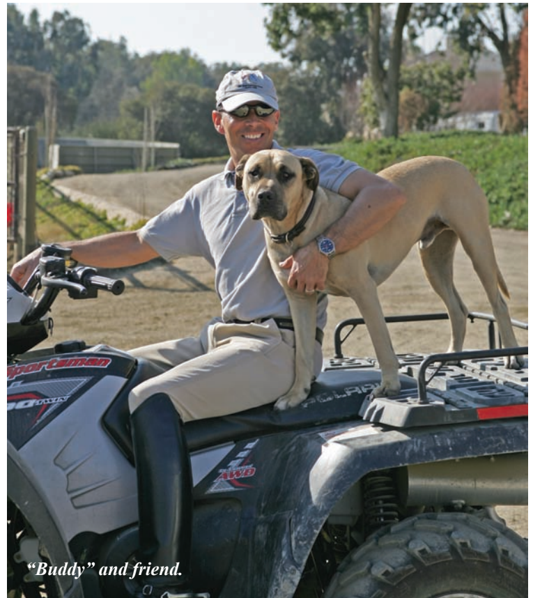
"Buddy" and friend.

"I tell everyone that when a customer comes here if they want us to use a pink hoof pick we're going to use a pink hoof pick. And we're going to report afterwards that we used the pink hoof pick."